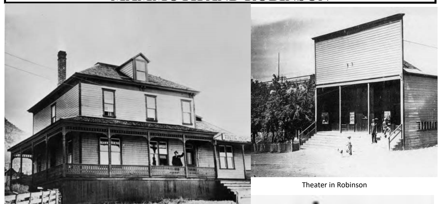
Tintic Hospital in Mammoth